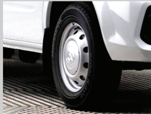
New 16" inch rims