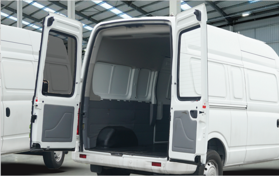
Rear barn doors with opening up to 255 degrees