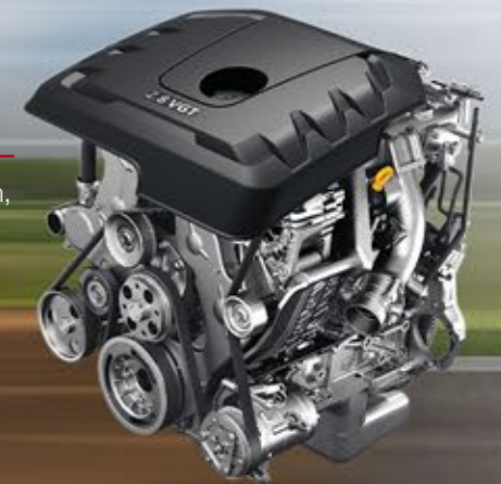
4-wheel Drive Shift with High and Low Range